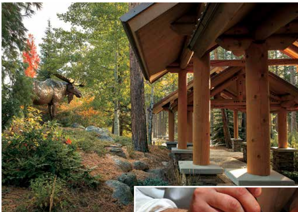
ABOVE: In addition to the classic two-dimensional mediums, the ranch art collection boasts a terrific array of sculpture. RIGHT: Many guests rate dining as one of their favorite experiences on the ranch. BELOW: A popular weekend event is the all-woman, four days of riding, nonprofit fundraiser, Klicks for Chicks .