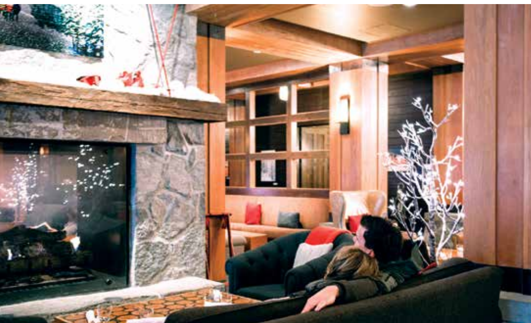
ABOVE: Nita Lake Lodge offers a complimentary shuttle taking guests to ski lifts at nearby Creekside—a cozy fireplace awaits them upon their return from the slopes. RIGHT: Bar Oso is known for its menu of speciality gin tonics as they call them (not gin and tonic as we say in the U.S.). BELOW: Whistler Village and its abundant nightlife options.